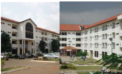
Diaspora Students Hostel