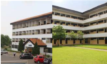
International Students Hostel (ISH)